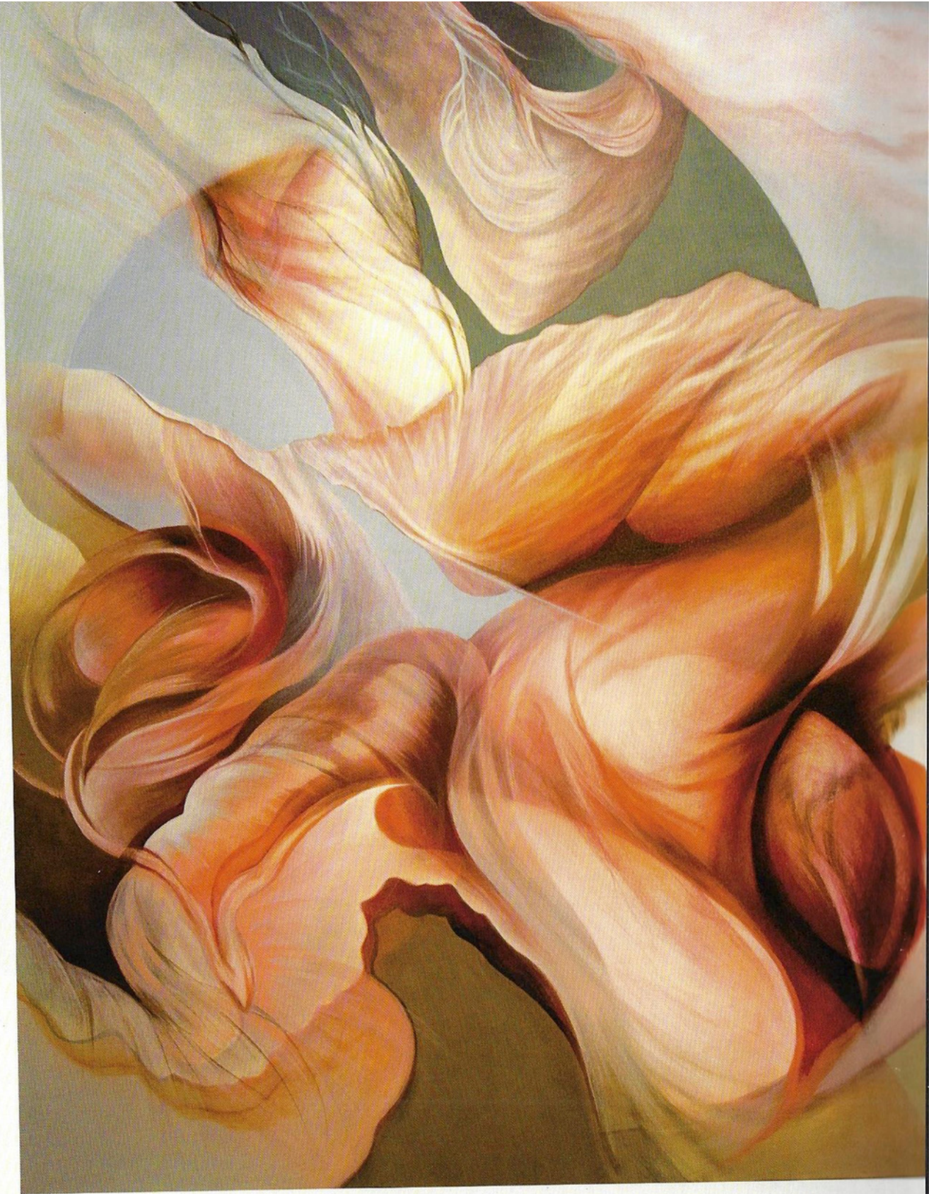
Lynn Schuette, Extraviado (Lost) , Acrylic on Canvas, 2012