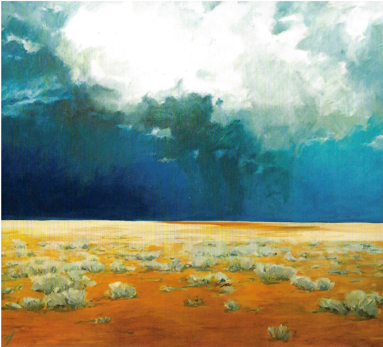
Carol Lindemulder, Road Trip, Afternoon Monsoon , Oil on Linen, 2009, Private collection